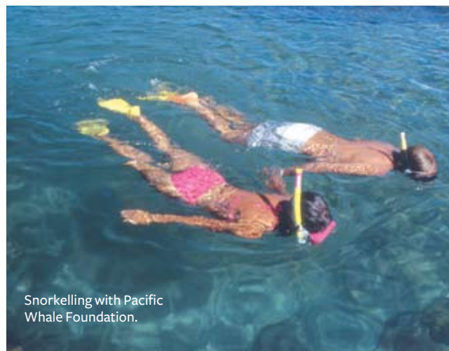
Snorkelling with Pacific Whale Foundation.

up with enough pasta salad, rice and vegetables to feed two.