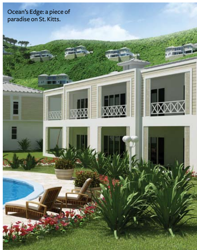
Ocean’s Edge: a piece of paradise on St. Kitts.

Though it’s challenging to find local joints on the more-developed west coast of Maui, Hana’s small-town vibe means that you’re in for a treat. Bypass the tour-bus heavy Hana Ranch restaurant for Braddah Hutt’s , just a minute further up the main road. From his front yard he grills up mahi mahi, steak, chicken and ribs—and for $10, he loads you